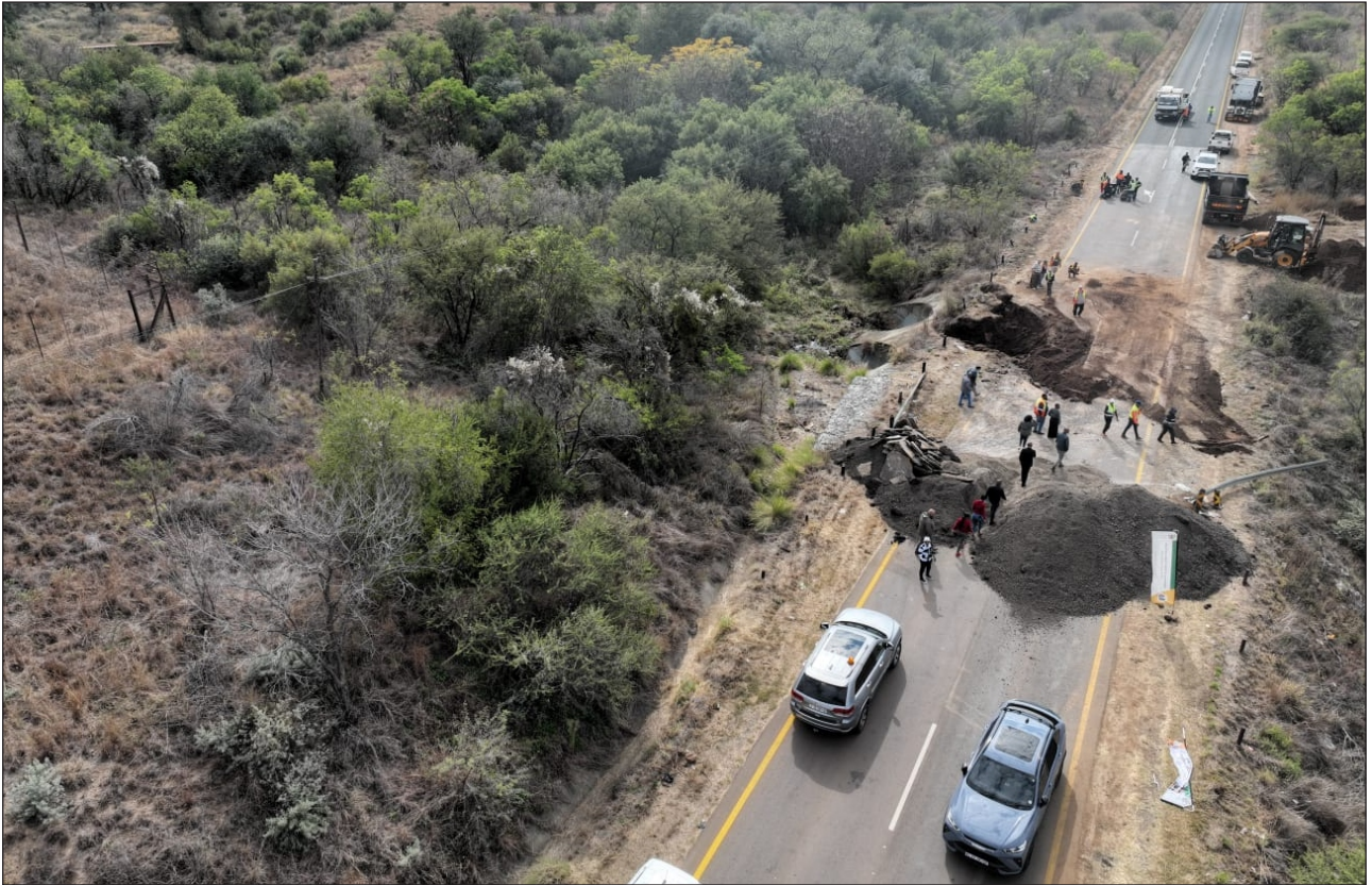
MEC Elizabeth Sempe Mokuwa accompanied by Head of Department, Moses Kgantsi leads a delegation on an oversight visit to assess progress following the collapse of the bridge due to inclement weather on the P53/1 Road between R510 and R565 towards Mogwase in Moses Kotane Local Municipality, Bojanala District.