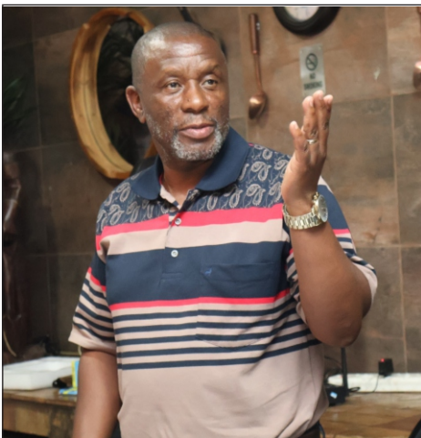
Chief Directorate: Immovable Asset Management hosted their first Provincial Government Immovable Asset Management (GIAMA) Forum meeting for 2026/2027 financial year in Mahikeng, Ngaka Modiri Molema District.

Held on a quarterly basis, GIAMA is a South African legislative framework designed to ensure the efficient, effective, and transparent management of immovable state properties (such as buildings and land) by national and provincial government departments