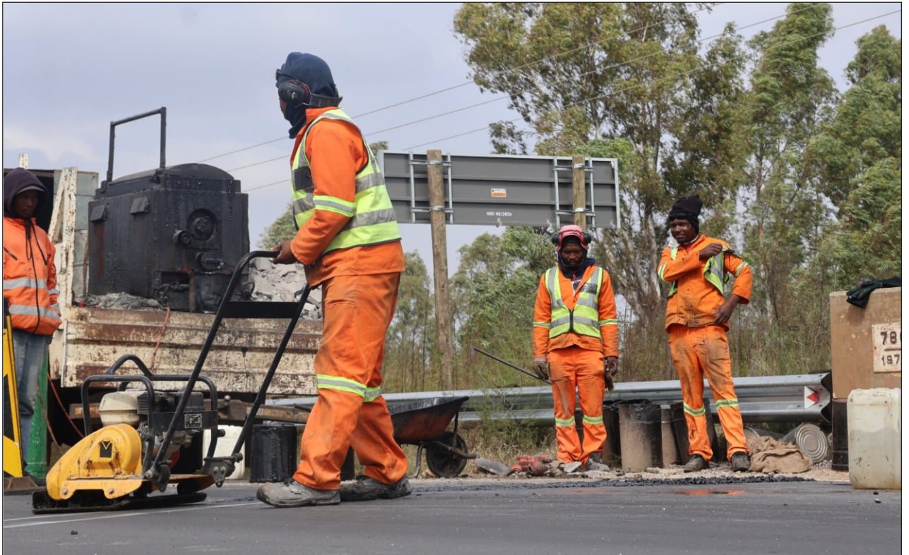
The rehabilitation and resealing of Road P13/4 from Wolmaranstad in Maquassi Hills Local Municipality in Dr Kenneth Kaunda District to Wesselsbron (Free State Border) has reached completion, marking a significant milestone in the department's ongoing efforts to improve road infrastructure, enhance road safety and strengthen connectivity between communities