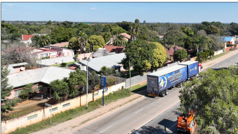
The Department completed the special maintenance of Road D424, Visser Street in Mahikeng and surrounding internal roads at a value of R68.8 million.