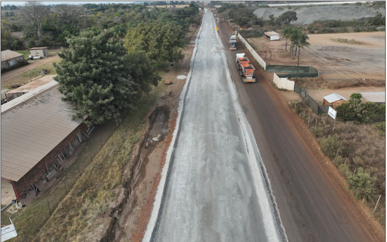
The 26-kilometer segment from Road P51 to the P2/4 (R104) connecting Majakaneng and Berseba in Madibeng Local Municipality has reached a 41% completion milestone. These efforts involve applying an asphalt overlay to specific areas and undertaking patch and reseal work on the rest of the road. MEC Sempe Elizabeth Mokuu's oversight visit on this road project in the Bojanala District was aimed at monitoring progress.