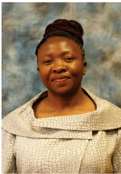
Hon. MEC Desbo Mohono