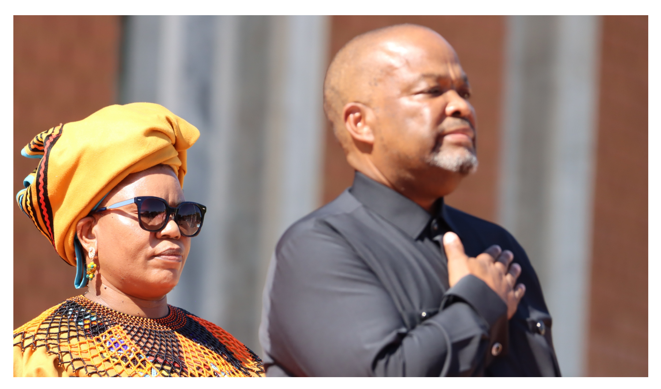
By Masego Tiro

orth West Acting Premier Nono Maloyi recently said that the Provincial Government, through the Department of Cooperative Governance and Traditional Affairs (CoGTA), is coordinating extensive intervention efforts to assist municipalities in the province to implement renewable and alternative energy sources.