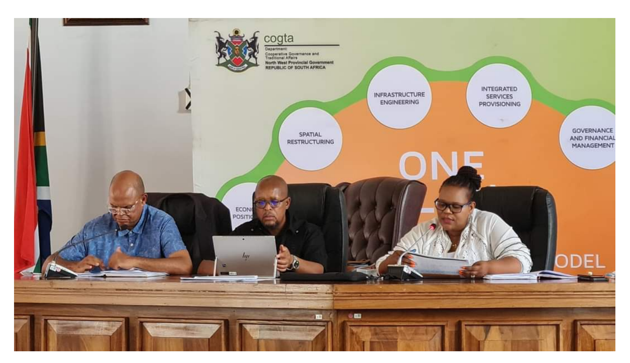
By Thebeetsile Keameditse

n its effort to strengthen municipal support and improve effectiveness in terms of Section 154 of the Constitution, the Department of Cooperative Governance and Traditional Affairs (CoGTA) convened one-on-one engagement sessions with all municipalities in the province to provide support and strengthen the capacity of municipalities to manage their own affairs.