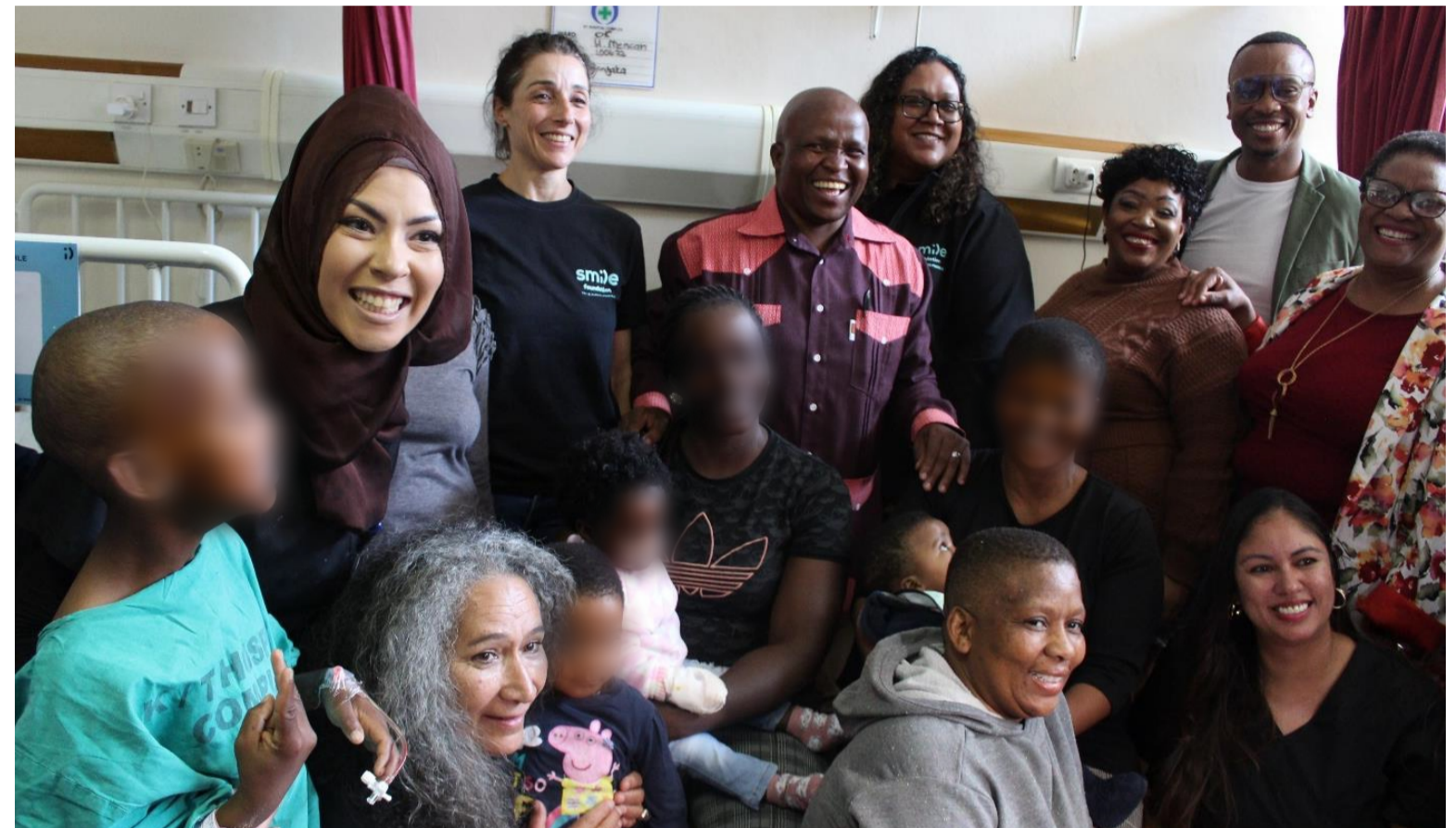
MEC for Health Madoda Sambatha with some of the team from the Smile Foundation and children who will receive the surgeries with their parents during the Smile Week Campaign at the Klerksdorp/ Tshepong Hospital Complex.

In Africa, 1 in every 700 babies is born with either a cleft lip or palate. Not only are clefts cosmetically disfiguring, but they also significantly affect the development of a child. Children with cleft lips and palates