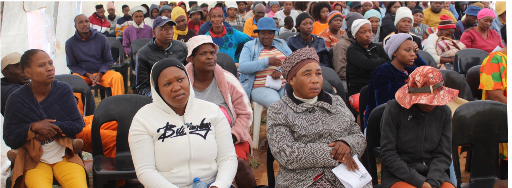
People from Leeudoringstad, Makwassie, Wolmaranstad, Witpoort, Boskuil and Oesenskraal attended the "Speaker Do Something" Public Participation Program in large numbers. The event was held in Rulaganyang (Witpoort) in Maquassi Hills Local Municipality.

The program is a key feature required to give effect to the "Batho Pele Principles". It is a part of the Public Participation process formed by the legal framework of Chapter 4 of the Municipal Structures Act (Act 117 of 1998) which provides municipalities with a legislative mandate to undertake programs that seek to enhance community involvement in matters of local government and providing an easy way for the members of the public to engage with municipalities regarding service delivery issues.