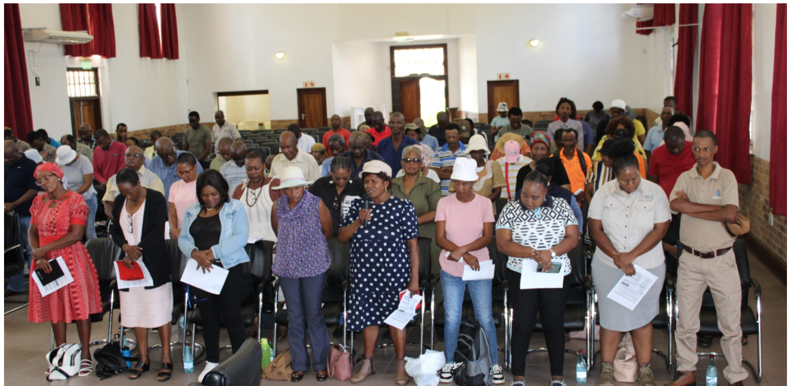
Farmers from the breadth of JB Marks Local Municipality attended the Farmers Workshop organized by the DR Kenneth Kaunda District Municipality and the Department of Agriculture and Land Reform in Potchefstroom.

This includes a coherent government in the delivery of services, realization of national priorities and monitoring of compliance and implementation of policies and legislations.