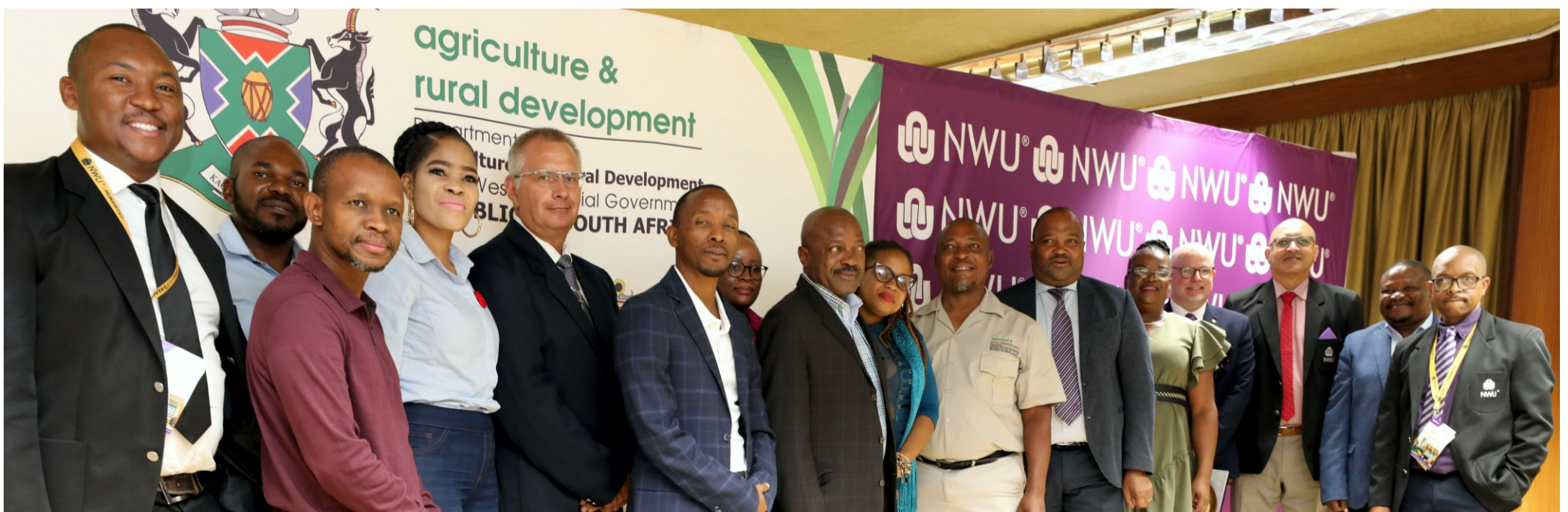
Group photo of officials from both the Department of Agriculture and Rural Development and the North West University after the signing of MOU ceremony.

The parties agreed that cooperation envisaged under this MOU will be on a project-by-project basis and shall endure for a period of five (5) years.