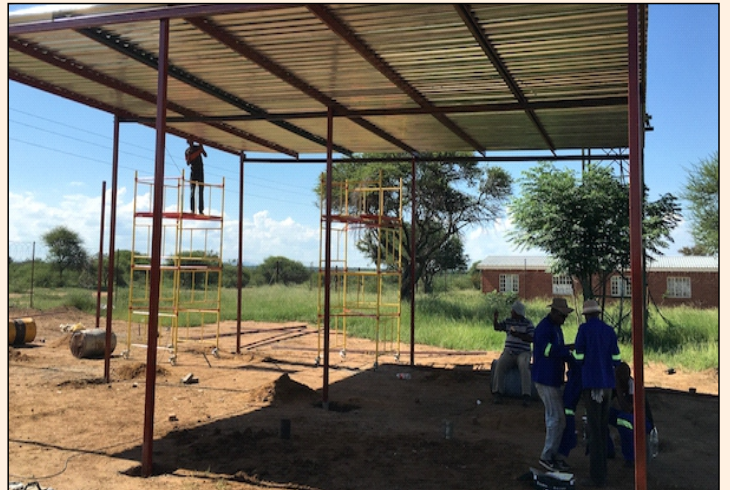
MORETELE BRICKMAKING PLANT: 15 temporary local jobs were created. The plant can produce up to 10 000 bricks per shift and double the amount in two shifts. A maximum of 80 EPWP work opportunities can be created. EPWP Beneficiary to be trained as brick making; Brick Paving and Business Skills. Cooperatives on Brickmaking and Brick paving to be developed.