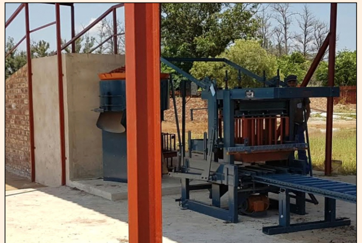
LEBALANGWE BRICKMAKING PLANT: 20 temporary local jobs were created. The plant can produce up to 10 000 bricks per shift and double the amount in two shifts. A maximum of 100 EPWP work opportunities can be created. EPWP Beneficiary to be trained as brick making; Brick Paving and Business Skills. Cooperatives on Brickmaking and Brick paving to be developed.