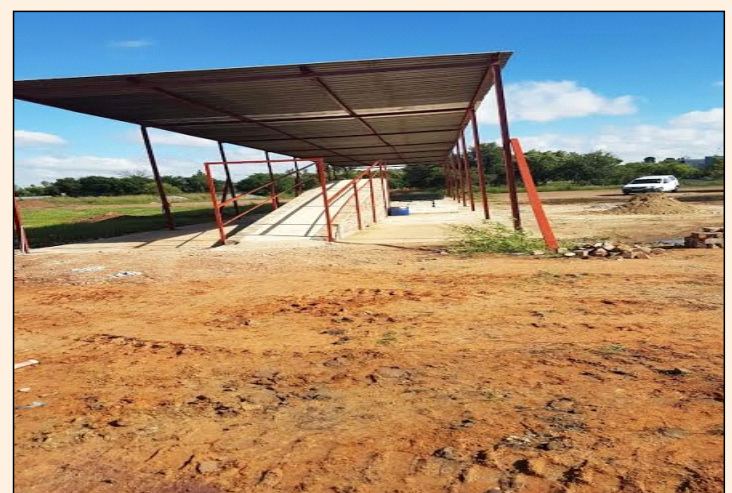
CHRISTIANA BRICKMAKING PLANT: 10 temporary local jobs were created. The plant can produce up to 5 000 bricks per shift and double the amount in two shifts. A maximum of 40 EPWP work opportunities can be created. EPWP Beneficiary to be trained as brick making; Brick Paving and Business Skills. Cooperatives on Brickmaking and Brick paving to be developed.