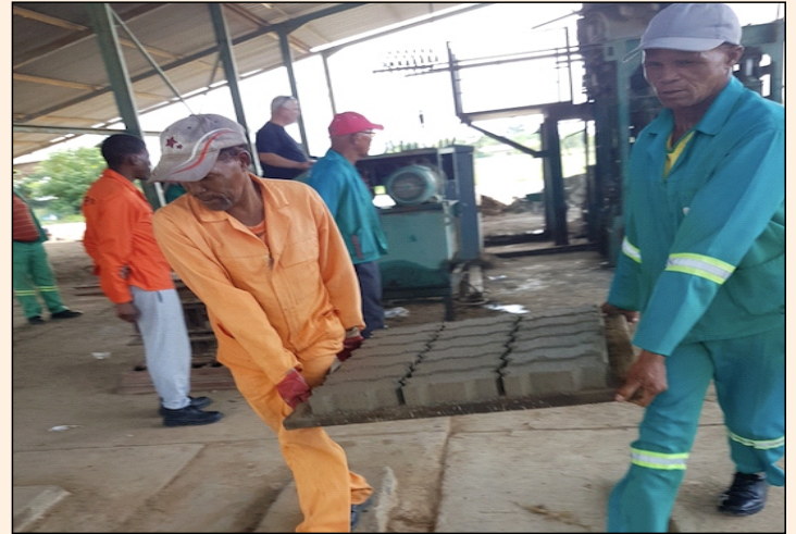
BLOEMHOF BRICKMAKING PLANT: 15 Temporary local jobs was created. This plant can produce 25 000 bricks per day per shift double the amount in two shifts. A maximum of 80 EPWP work opportunities can be created. EPWP Beneficiary to be trained as brick making; Brick Paving and Business Skills. Cooperatives on Brickmaking and Brick paving to be developed.