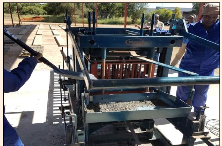
VENTERSDORP BRICKMAKING PLANT: Temporary local jobs were created. The plant can produce up to 5 000 bricks per shift and double the amount in two shifts. A maximum of 40 EPWP work opportunities can be created. EPWP Beneficiary to be trained as brick making; Brick Paving and Business Skills. Cooperatives on Brickmaking and Brick paving to be developed.