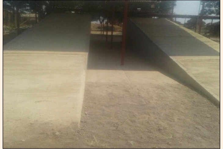
DRYHARTS BRICKMAKING PLANT 10 Temporary local jobs was created. This plant can produce 10 000 bricks per day per shift double the amount in two shifts. A maximum of 40 EPWP work opportunities can be created. EPWP Beneficiary to be trained as brick making; Brick Paving and Business Skills. Cooperatives on Brickmaking and Brick paving to be developed.