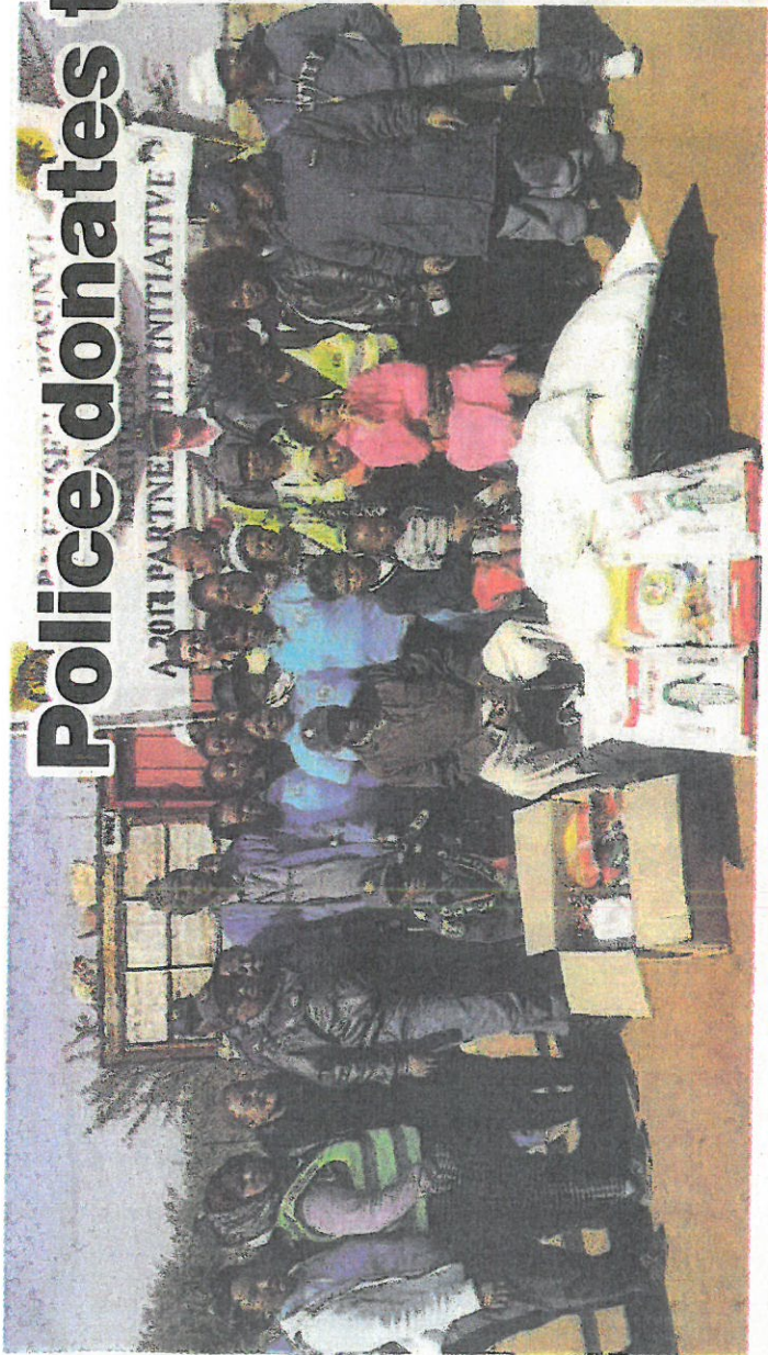
Mahikeng Police, Women's Network, Men for change and CPF handing over food parcels to the Mokokoe family.