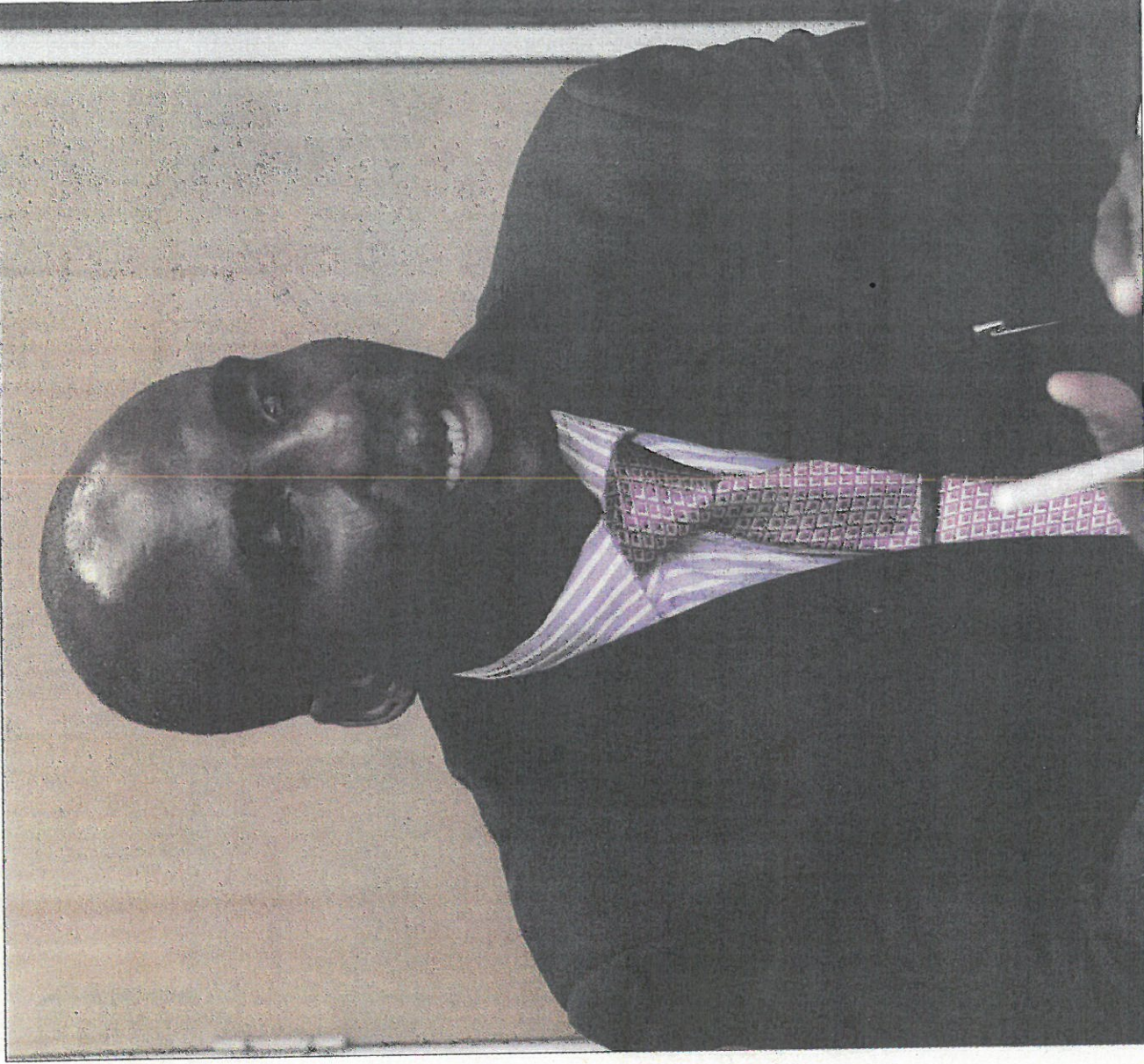
The Minister of Transport, Joe Maswanganyi, addresses the media at the Southern African Transport Conference at the CSIR in Pretoria.

Maswanganyi added that individuals and companies would be taken to court, based on the merit of the particular case.