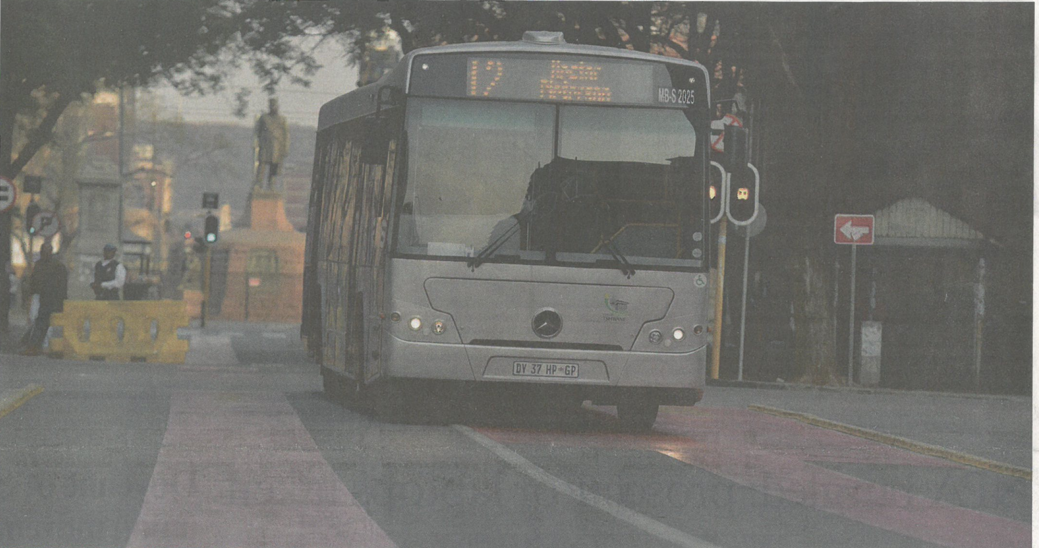
An A Re Yeng bus leaves Church Square.