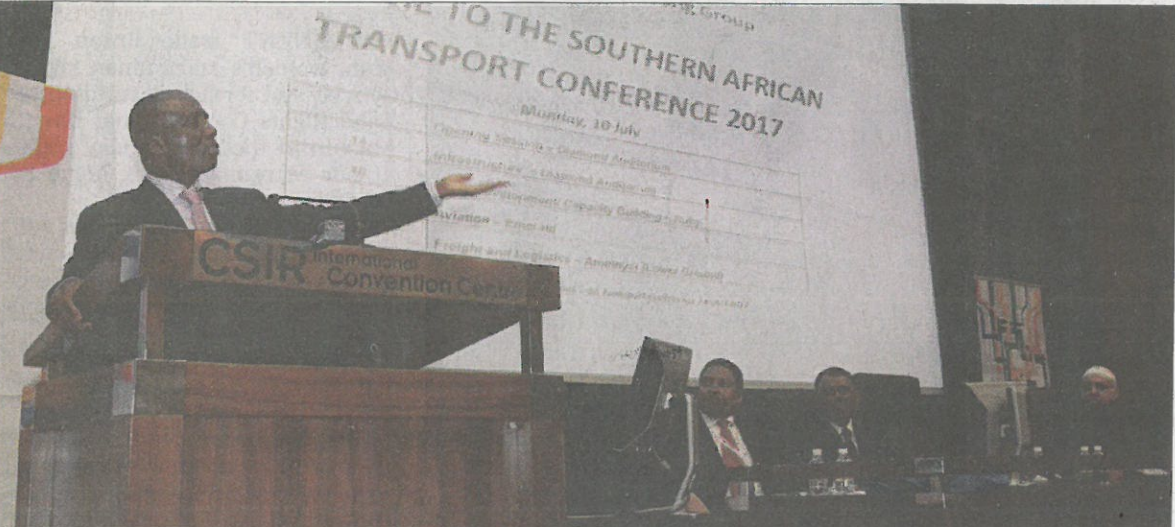
Transport Minister Joe Maswanganyi delivers the opening address at the Southern African Transport Conference at the CSIR International Convention Centre.