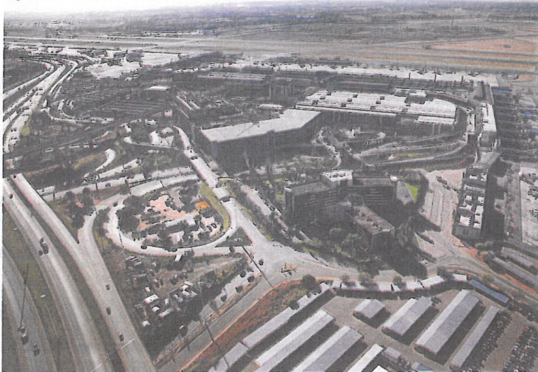
An aerial photograph of OR Tambo International Airport in Kempton Park, a target of criminal gangs who regularly rob travellers and goods storage facilities.

However, the police managed to recover the truck and the goods, but the robbers were able to flee the scene.