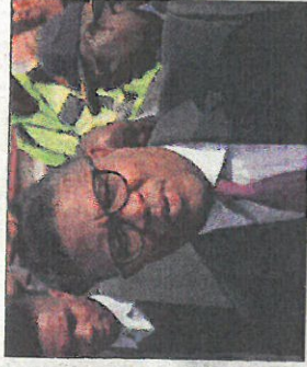
ENOUGH: Fikile Mbalula

“Those police officers who are corrupt and who have been doing their things in a clandestine manner, we will