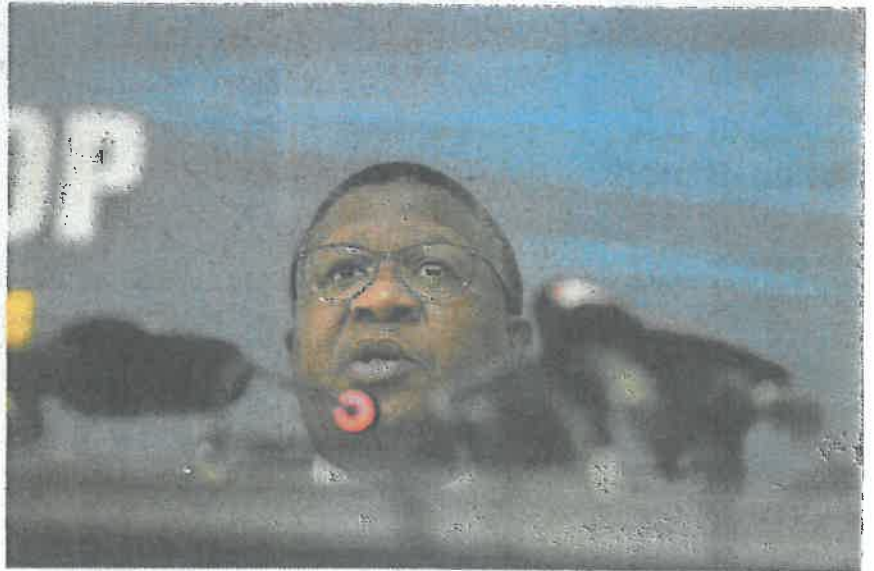
HUNT STILL ON. Minister of Police Fikile Mbalula says a few suspects are still on the loose.

According to Mbalula, Amcu leaders were being killed because