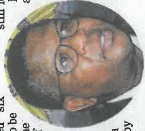
Police Minister Fikile Mbalula says more arrests will be made.

"They ensured we get rid of these criminals who think they are untouchable," he added. The arrested people are accused of killing several Amcu members in a short space of time in Septem-