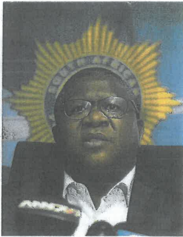
Police Minister Fikile Mbalula addressed the media in Rustenburg yesterday about the Platinum Belt killings.

66 We send the message SA is not a banana republic