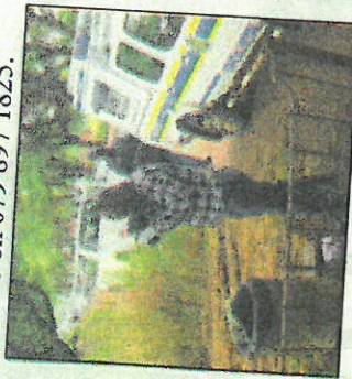
Forensics officer taking images at the scene