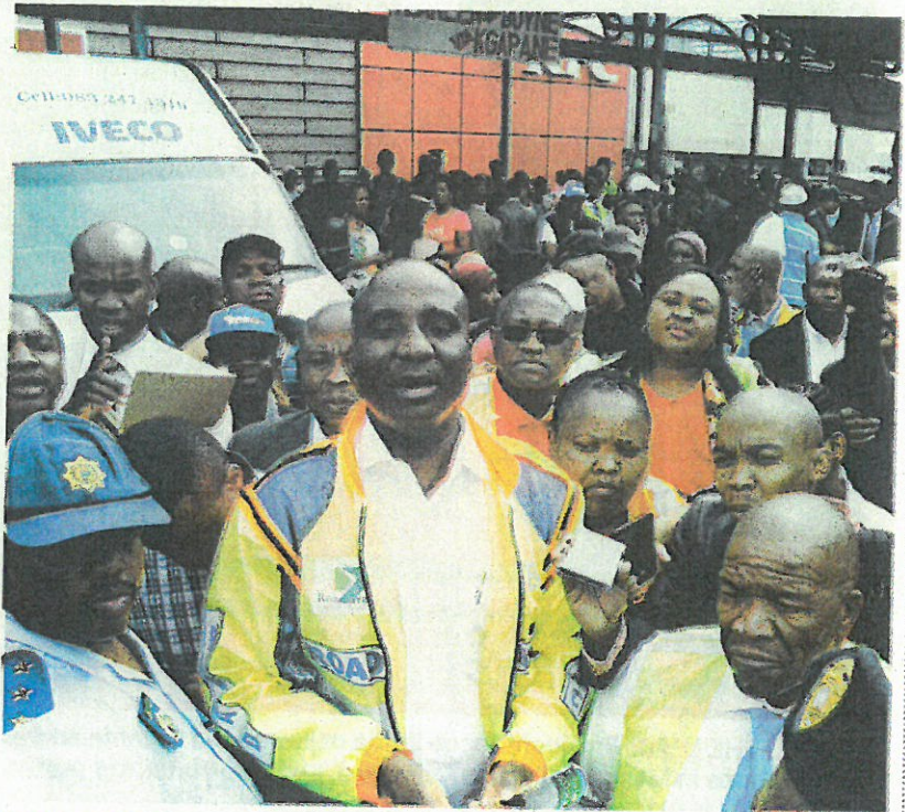
ROAD SAFETY: Transport Minister Joe Maswanganyi has urged motorists and pedestrians to be cautious over the long weekend.

Maswanganyi said alcohol, speed and not wearing seat belts were seen to have contributed to fatalities and injuries during the Easter road safety campaign.