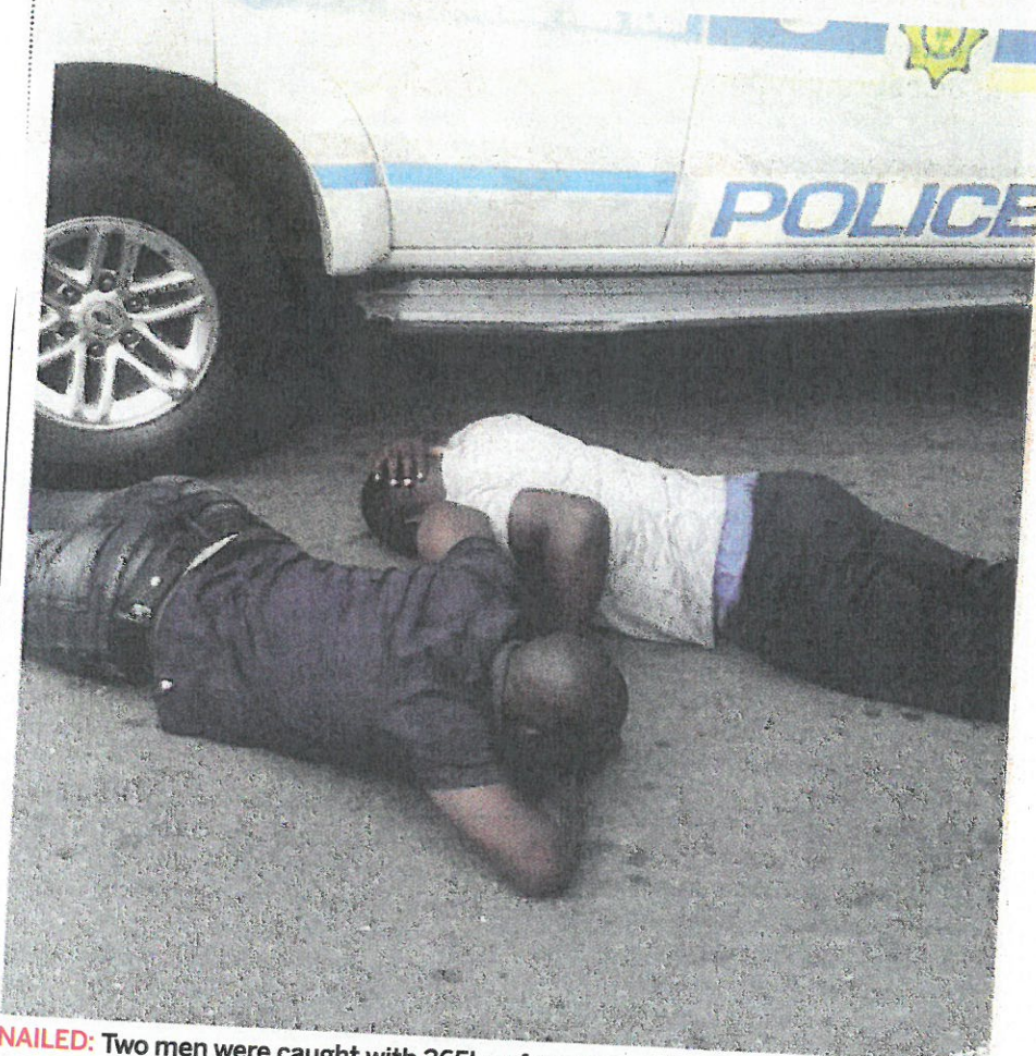
NAILED: Two men were caught with 265kg of copper cables stolen from an Eskom power station in Stilfontein.