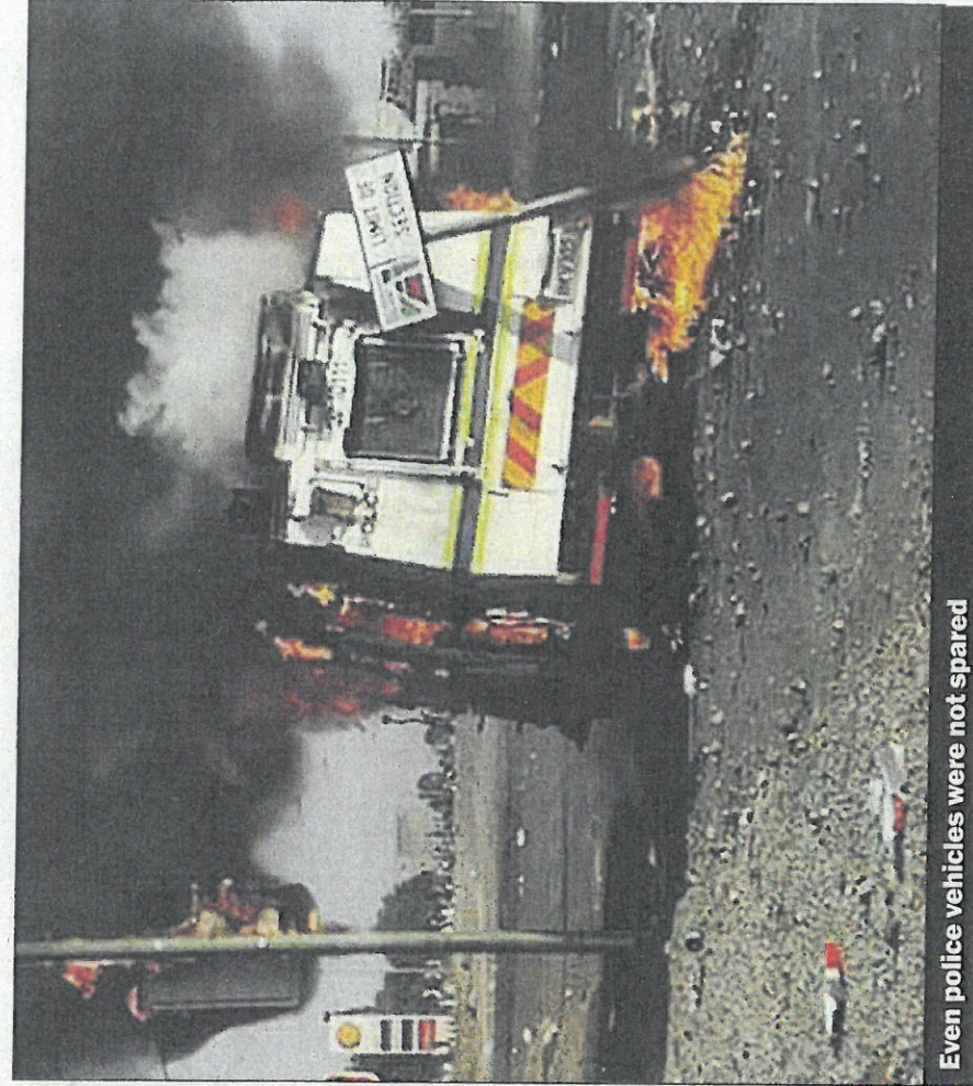
Even police vehicles were not spared

"Community members must always make the necessary arrangements when planning protest action and citi-