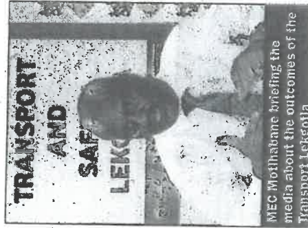
MEC Mofhegane briefing the media about the outcomes of the Transport Lekgotla

"South Africa's transport infrastructure has a direct impact on the growth of the economy, contributing 48% to the Gross Domestic Product (GDP). Transport determines the efficiency at which we do business in our country and if enough investment is put into the sector we could see some positive growth in our economy."