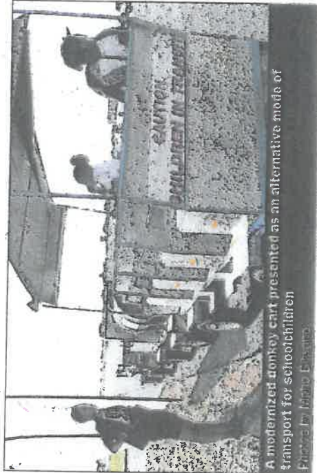
A modernized donkey cart presented as an alternative mode of transport for school children.

"We had already started piloting the Mahikeng-Johannesburg rail route, but due to issues that are currently facing the