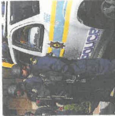
SAFE SEASON: Police are increasing efforts this holiday.