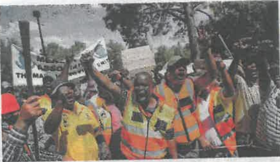
MAKING A POINT. Taxi drivers on the way to deliver a memorandum to the department of transport yesterday.

→ Calls for scrapping 'draconian' legislation and 'unworkable' re-capitalisation plan. TRANSPORT The CITIZEN 09/11/2017 Pg 2 Rorisang Kgosana