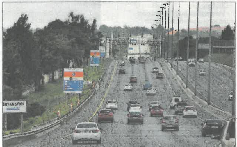
Sanral has faced fierce resistance against e-tolling in Gauteng with motorists refusing to pay since the system went live in December 2013.

"We need to engage South Africans to avoid a situation where they resist tolling. There is a negative perception and resistance to tolling, and as a result we are not creating as many jobs as we would have loved to do." – ANA