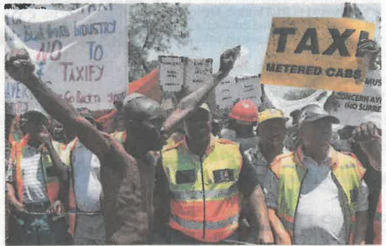
Taxi operators during their march to the Union Buildings in Pretoria yesterday have given Transport Minister Joe Maswanganyi 21 days to respond to their demands.

"Without a doubt, we are calling on the president to fire this minister (Maswanganyi). Not only is the minister useless, he is also hopeless. Therefore, we are not deserving of such a minister."