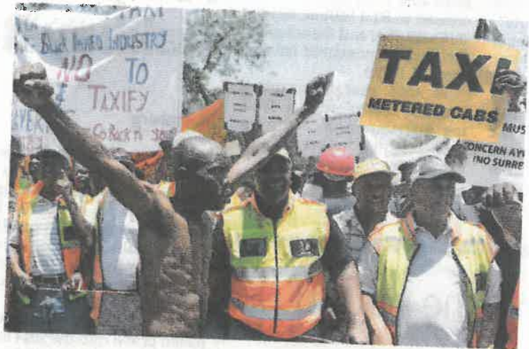
Taxi operators during their march to the Union Buildings in Pretoria yesterday have given Transport Minister Joe Maswanganyi 21 days to respond to their demands.

"Without a doubt, we are calling on the president to fire this minister (Maswanganyi). Not only is the minister useless, he is also hopeless. Therefore, we are not deserving of such a minister,"