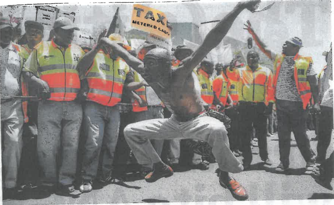
WAR CRY. Taxi drivers sing and dance during a march to the Union Buildings yesterday.