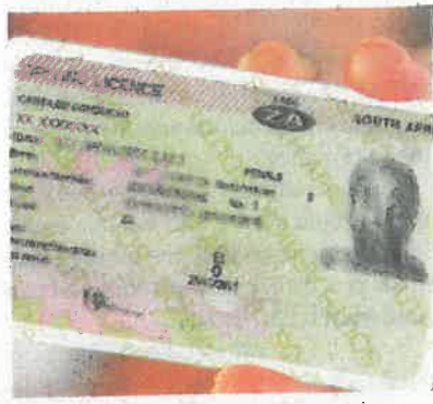
SECURE: Legally licensed driver.

Yesterday, the department said it was winning the battle against fraudsters involved in illegal obtaining of licences