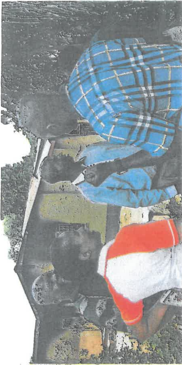
COUNTING THE COST: Rustenburg residents affected by the recent spate of violence assess the extent of the damage to properties.