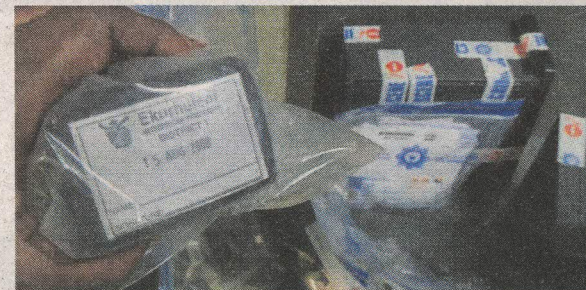
Cops confiscated stamps, computers, printers and fake bank statements.

“We want to remove people with fraudulent docu-