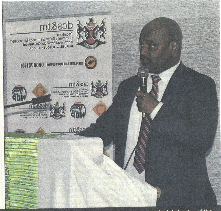
Deputy Minister for Transport Sindisiwe Chikunga and MEC for Public Safety and Transport Management, Dr Mpho Motlhabane launched Provincial chapter of the South African Network for Women in Transport (SANWIT) in Mmabana Taung.