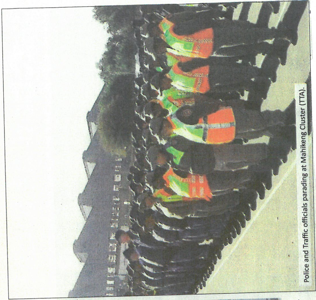
Police and Traffic officials parading at Mahikeng Cluster (TTA).