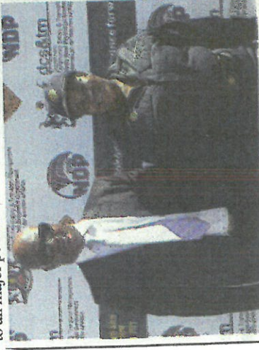
The MEC of NW Community Safety and Transport management, Mpho Motlhabane, alongside NW Provincial Commissioner, Lt Gen Baile Motswenyane.