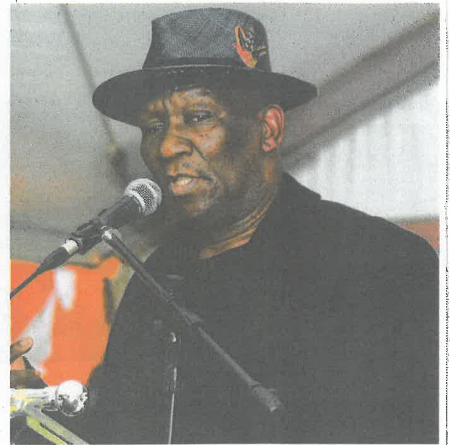
LAUDED: Police Minister Bheki Cele recently appointed new heads of various SAPS divisions.