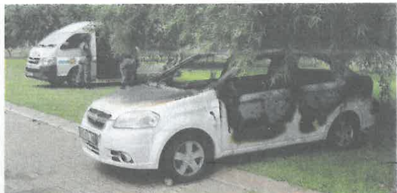
A car that was torched by residents.