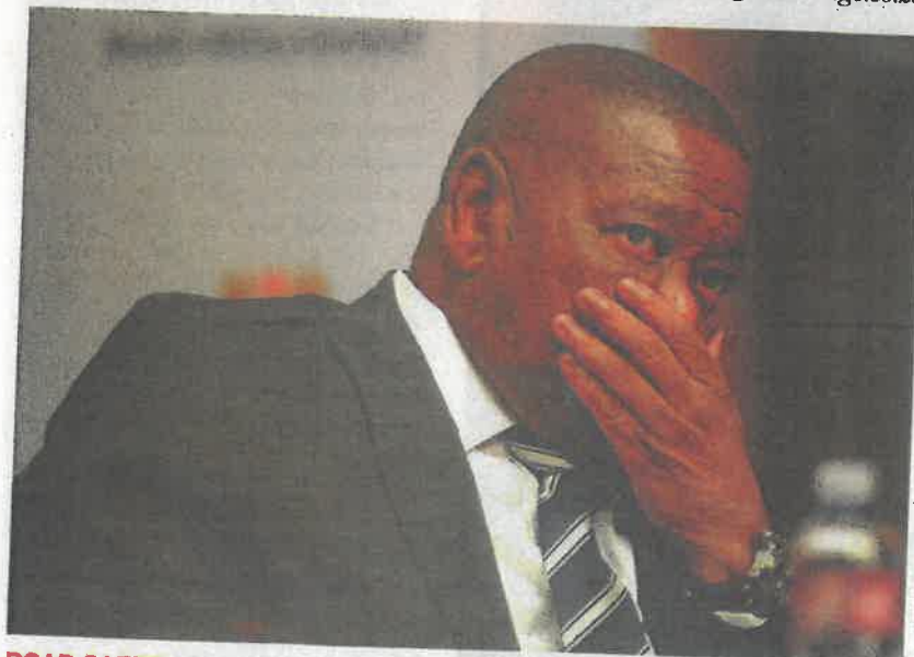
ROAD SAFETY: Minister of Transport Blade Nzimande.